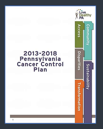
Pennsylvania Cancer Control Plan

PA DEP/Bureau of Radiation Protection 400 Market Street Harrisburg, PA 17101